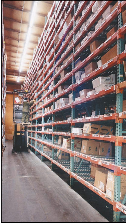
Worker loads product from back of rack. Span-Track consistently flows product to “last in” position for strict inventory rotation.

SIC#5141 Groceries & General Line Smart & Final